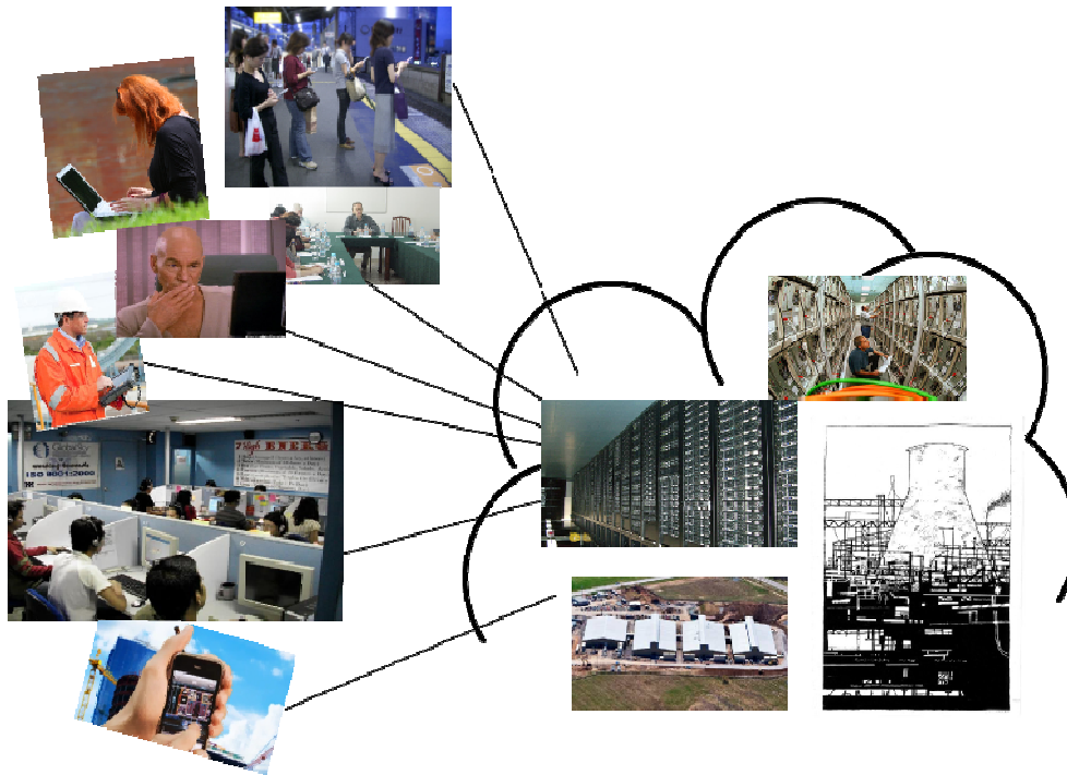
Figure 1. The cloud is full of servers that need power, and a user doesn't need "a computer" any longer.

The catch phrase is "computing as a service rather than a product" and the idea is to use computing services over the network on an as-needed basis rather than having to buy and maintain in-house computers and software [2]. This can lead to cost savings for the PA – for example by services being hosted where electricity is cheaper – but perhaps the cloud model's greatest advantage is that these or equivalent resources are available to developers too. Thus cloud computing is an opportunity to lower the barriers to entering the software provision business, opening up competition, which in turn has the potential to dramatically improve the quality of the service provided.