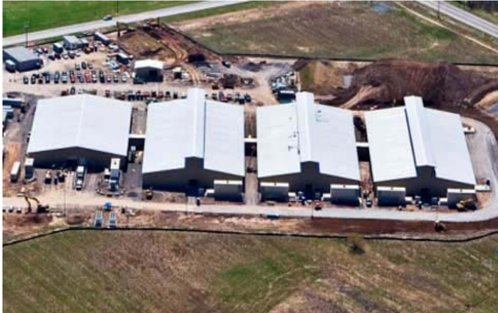
Figure 2. The Yahoo! data centre in Lockport, New York

These data centres are power intense, an average of 3.3 kW per square metre [25], and including the power consumption of desktop computers, laptops and smart phones on the client end, the carbon foot print of IT exceeded that of the aviation industry for the first time in 2007. As reported in the Telegraph on the 9th of January 2009 (and countered 5 days later in the same paper) two Google searches, on average, produce as much carbon as boiling the kettle.